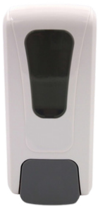
Product code: lsd001