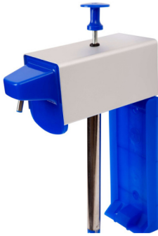
Product code: apwd04

The Grit Master hand cleaner dispenser is the most reliable grit hand cleaner dispenser on the market. Perfect for a high traffic wash room. If your looking for a indestructible dispenser that can handle the day to day rigors of an industrial environment this is the dispenser for you. This dispenser is suitable for all our 4 litre pack sizes.