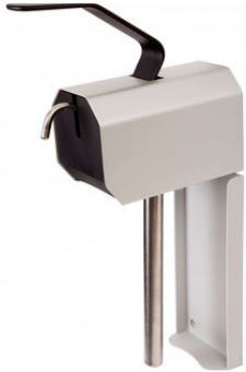
Product code: gritdisp

The Grit Master hand cleaner dispenser is the most reliable grit hand cleaner dispenser on the market. Perfect for a high traffic wash room. If your looking for a indestructible dispenser that can handle the day to day rigors of an industrial environment this is the dispenser for you. This dispenser is suitable for all our 4 litre pack sizes.